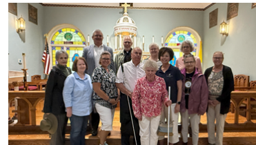
Immaculate Conception Legacy Society